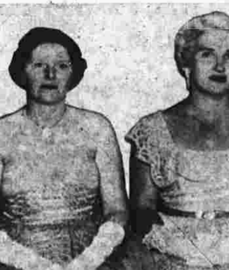
Portrait of a woman, likely an officer of the Emblem Club.